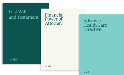
Validate Your Documents